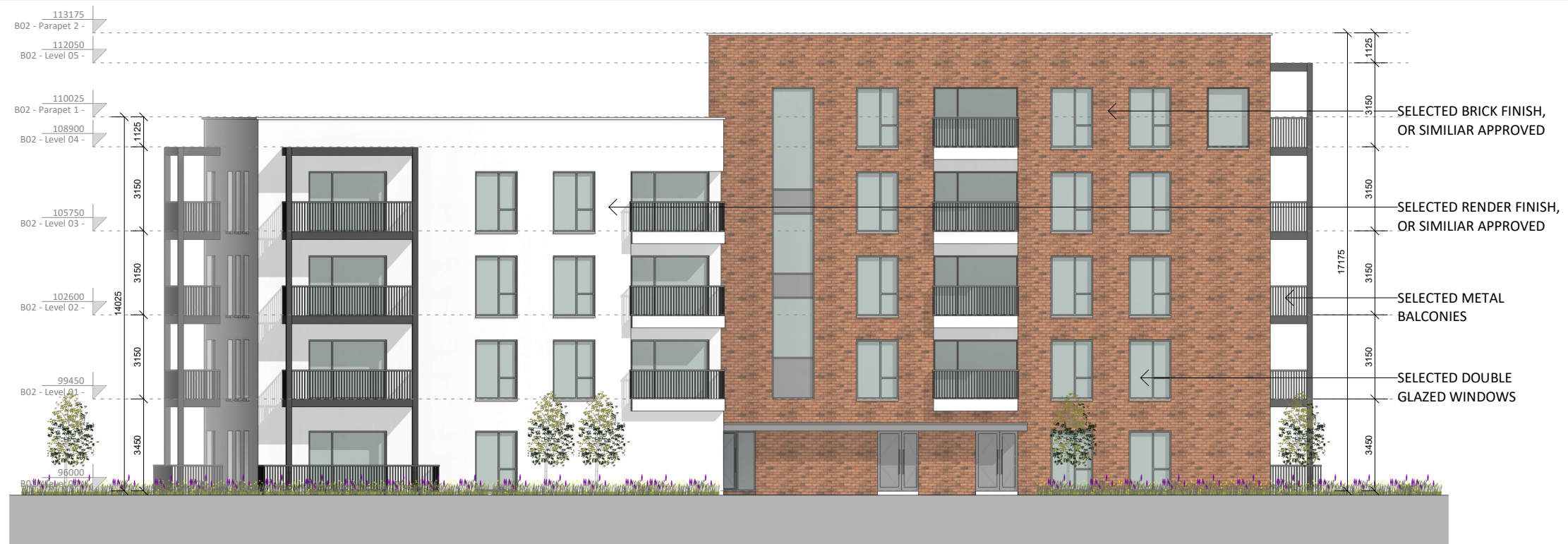
1 Block 02 - East Elevation 1 : 200