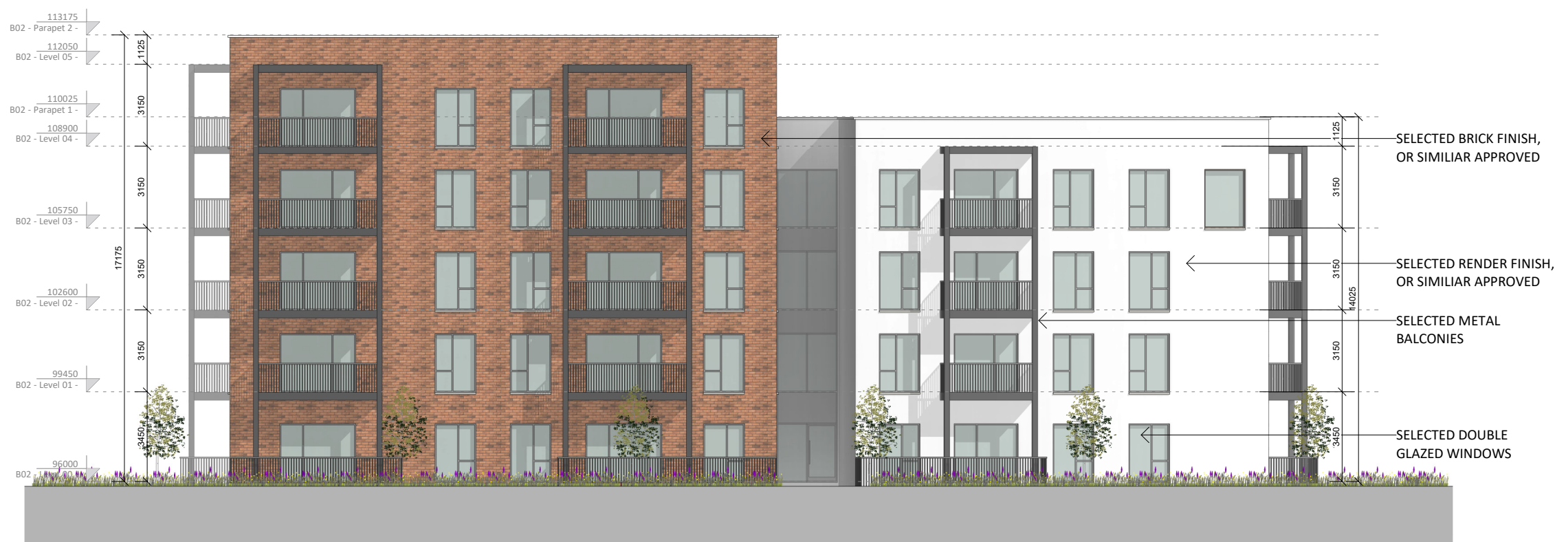
2 Block 02 - West Elevation 1 : 200